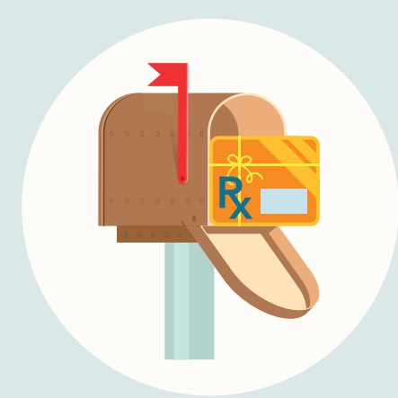
Mail order discounts and reduced copays

Unlike Original Medicare, Medicare Advantage plans can include bundled prescription drug coverage at no additional premium. They can also include mail order pharmacy benefits that can lower prescription costs and offer convenience.