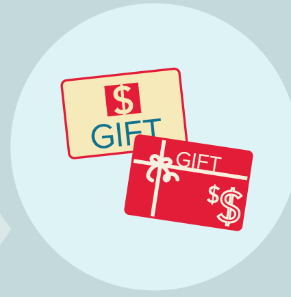
Rewards programs for completing healthy activities